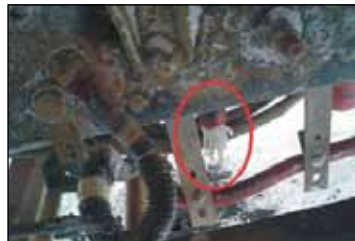
Figure 2: Ice in road draft tube