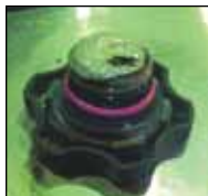
Figure 3: Sludge on breather cap

NOTE: For further information, pictures, and part numbers, reference Cummins® TSB 140017. This technical service bulletin can be located on QuickServe Online in the "TSB" tab under the "Service" section.