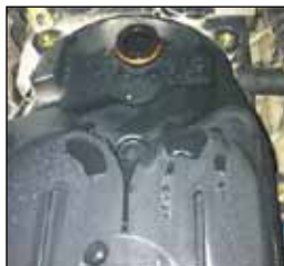
Figure 1: Condensation on outside of breather

This document informs the field of ISB 6.7 engines experiencing a freezing breather filter or ice in the road draft tube in below freezing temperatures. Oil leaks (at the turbocharger seal, valve cover gasket, and rocker housing gasket) and high pressure crankcase codes will most likely be observed.