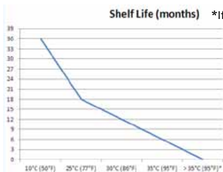
*If stored above 35°C (95°F) significant loss of shelf life has occurred. Check the quality before every use.

In these conditions, diesel exhaust fluid has a minimum expected shelf life of 18 months. Each 5°C [9°F] increment above recommended temperatures reduces shelf life by 6 months. (For example 30°C [86°F] = 12 month shelf life, 35°C [95°F] = 6 month shelf life, etc.)